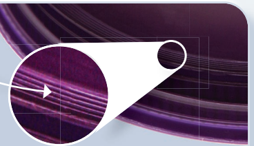
CLOSE-UP OF CLOSURE INNER-EDGE

A closure that has been engineered to function in specific application without the use of an additional liner. This is usually achieved with a series of small ridges inside the closure that has direct contact with the container's lip.