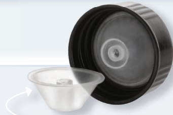
PICTURED INSIDE AND OUTSIDE CLOSURE

This type of liner is made of a vinyl coating applied to High Density Polyethylene (HDPE) coated paper, which is then laminated to pulpboard. P.V. liners are perfect for general use.